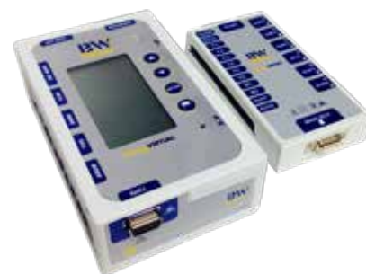
BW MINI PSG/HST

Karen: Products are very intuitive and user friendly, reliable, and have a very good track record. The quality of the signals is adequate. The brand is increasingly becoming well-recognized in Colombia and around the world. In Colombia, the number of sleep labs using Neurovirtual equipment is on the rise. Accessories are standard for all Neurovirtual models products, easy to use, have an appropriate lifespan, and do not damage easily. Neurovirtual has a team members with experience in all areas of sleep medicine and neurology: We can count on their support 24 hours, seven days a week; they have highly trained support specialists.